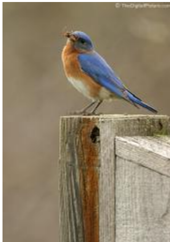
Spiders for Lunch!