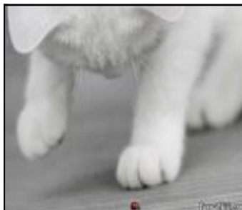
Ladybugs for Play!