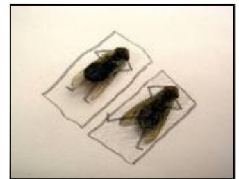
At the Beach