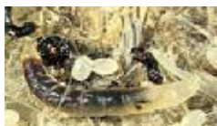
Fleas in a carpet

Yellow Jackets are a major pest problem in September. Their nests are now very large, often with several hundred insects in the colony. They are very hungry for anything we eat, especially at a picnic including meats, sweets, soft drinks and beer. They break through ceilings on a regular basis; We break through into their nests when we walk over their subterranean homes. Sound familiar?