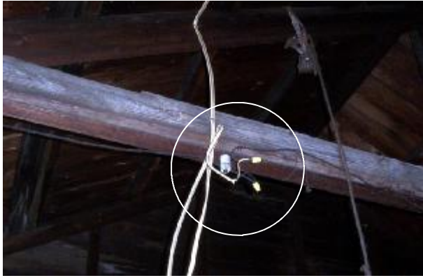
Romex spliced with knob and tube wiring