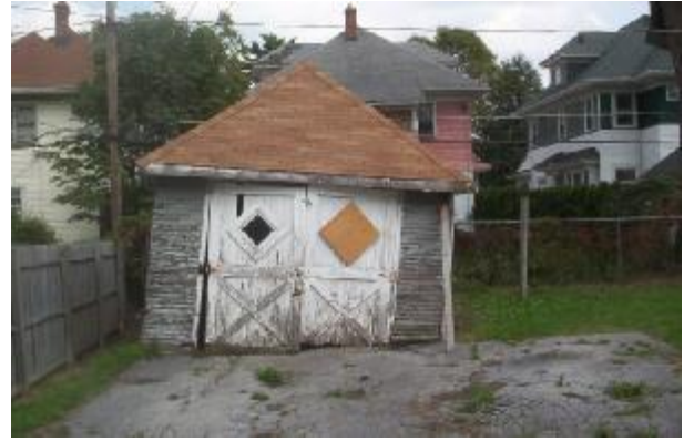
That sinking feeling...