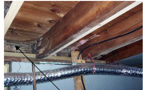
Termite Damage; Basement Framing