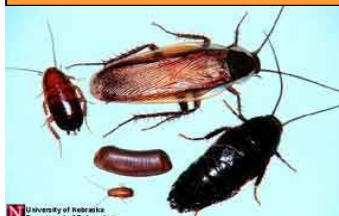
Pennsylvania Wood Roach

"To Grandmother's House We Go!" Winter's Travelers